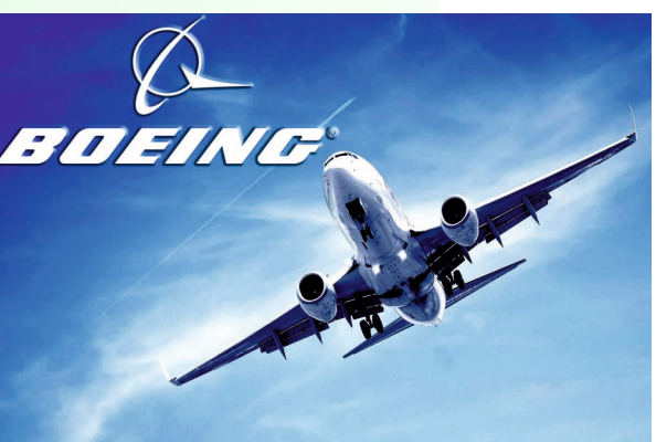
Aero Manufacturing Hub