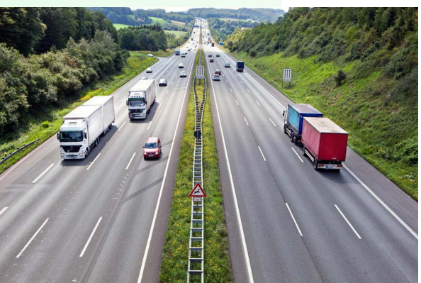
Roads & Infrastructure