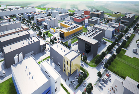
Electronic - City